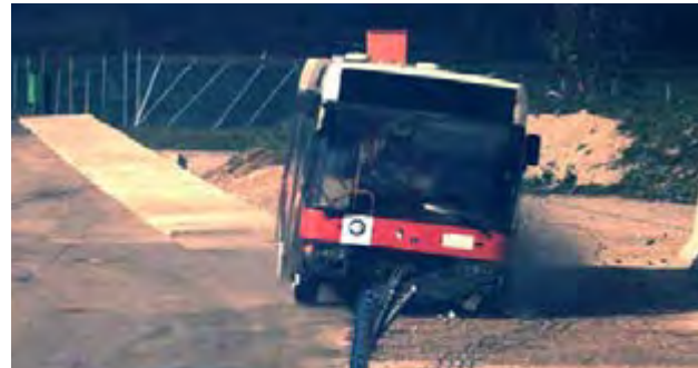
Impact test EN 1317-2 - TB 51