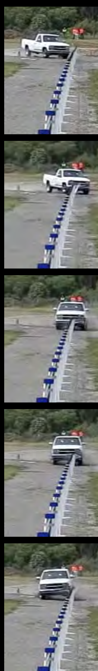
Impact test NCHRP 350 - 4-11