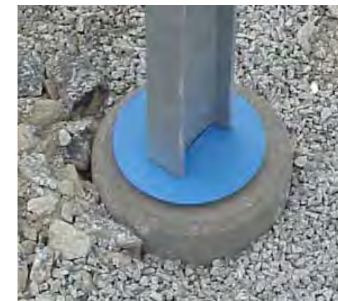
2. Posts are placed in ground condition dependant footings.