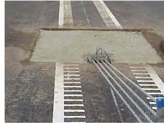
1. Anchors are prefabricated or cast on site.