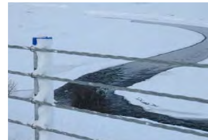
SAFENCE has proven to be very effective in snow and sand without causing drifts to settle around the road restraint system.