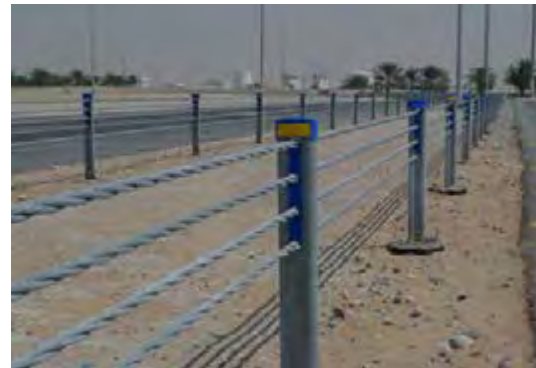
United Arab Emirates