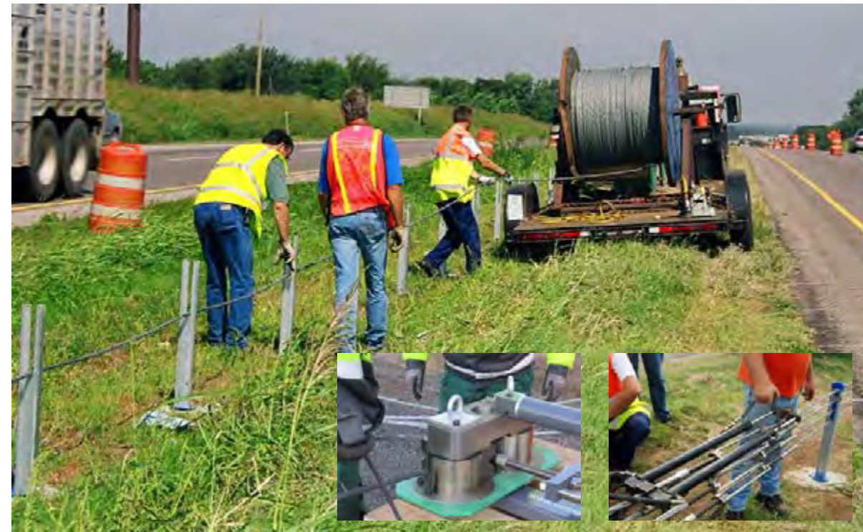
3. Wire rope is mounted and end fittings are swaged on site. SAFENCE Wire Rope Safety Fence is ready to save lives in just a few steps!