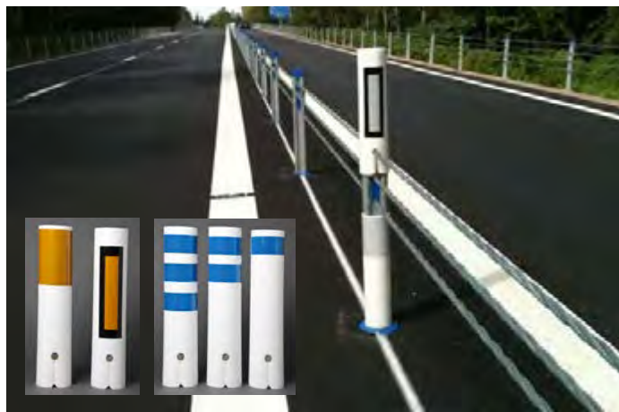
A selection of our line of reflectors.

A typical Swedish 2+1 lane road is often divided by SAFENCE median barrier and include SAFENCE slope or side barriers depending on surrounding environment.